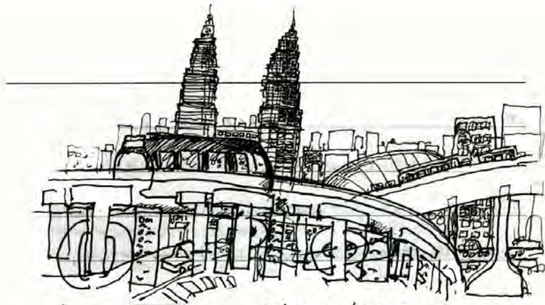
petronas towers city scorpe from head!